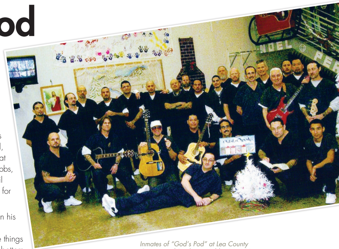
Inmates of "God's Pod" at Lea County Correctional Facility in Hobbs, New Mexico