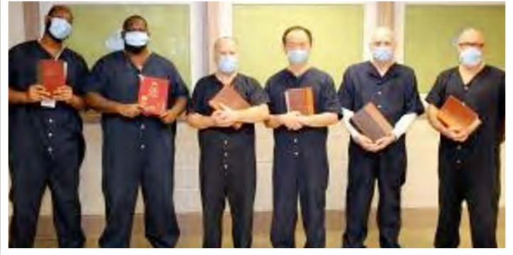
Six inmates in Florida recently completed our Bible Study Course