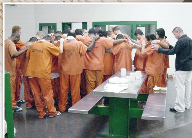
Inmates pray at Hudson County Correctional Center