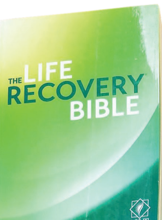
The Life Recovery Bible